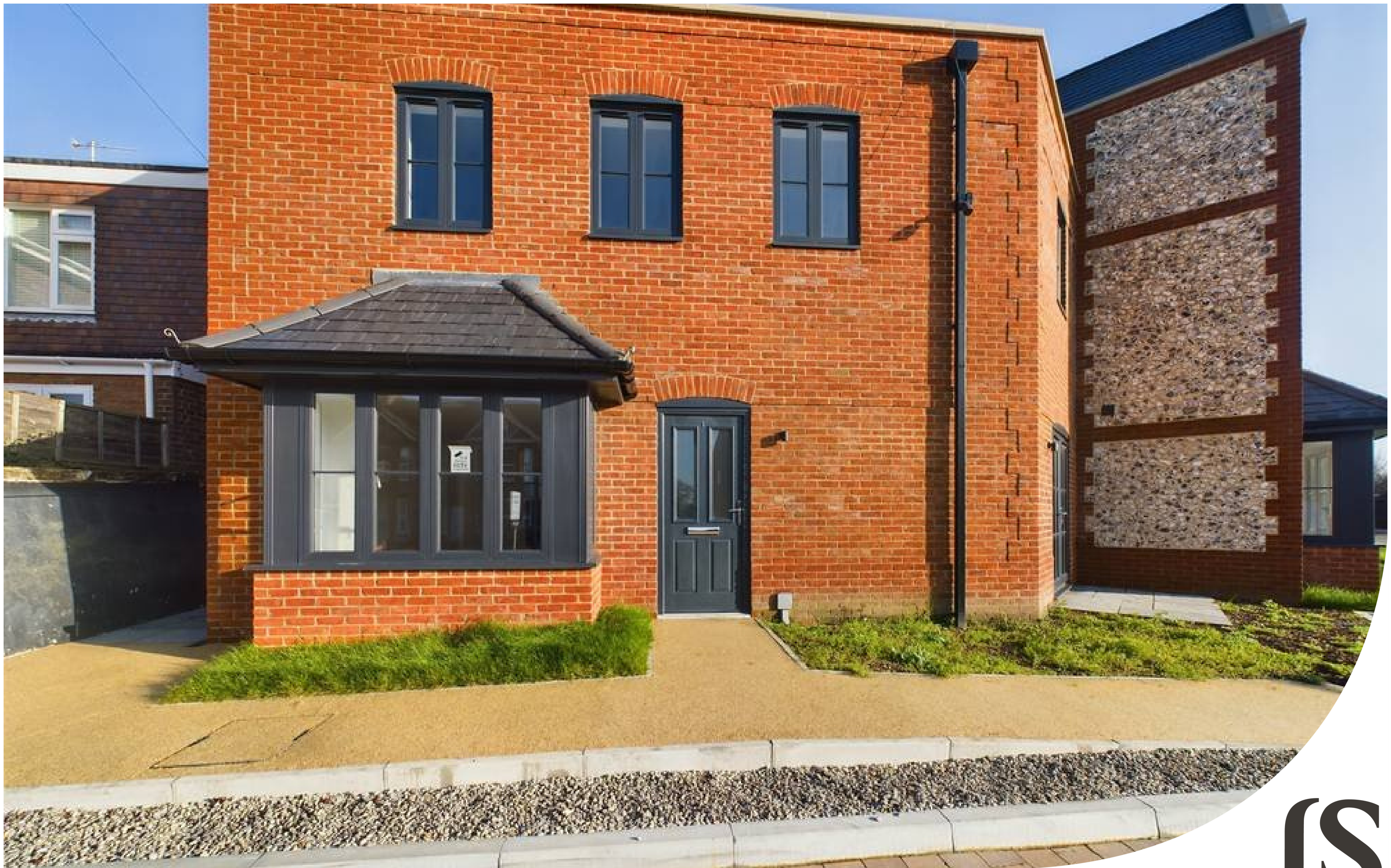
Knights Gate , Sompting, Lancing, BN15 0FE Offers Over £475,000